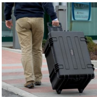
WHEELS AND TELESCOPIC HANDLE (model 5833)