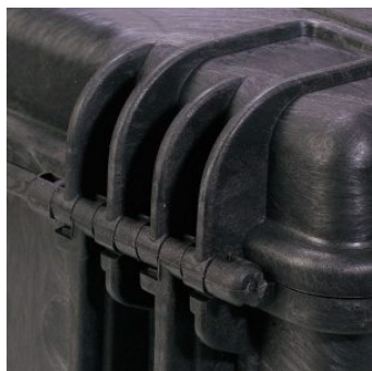
CORROSION PROOF METAL HINGES WITH LID STAY FEATURES