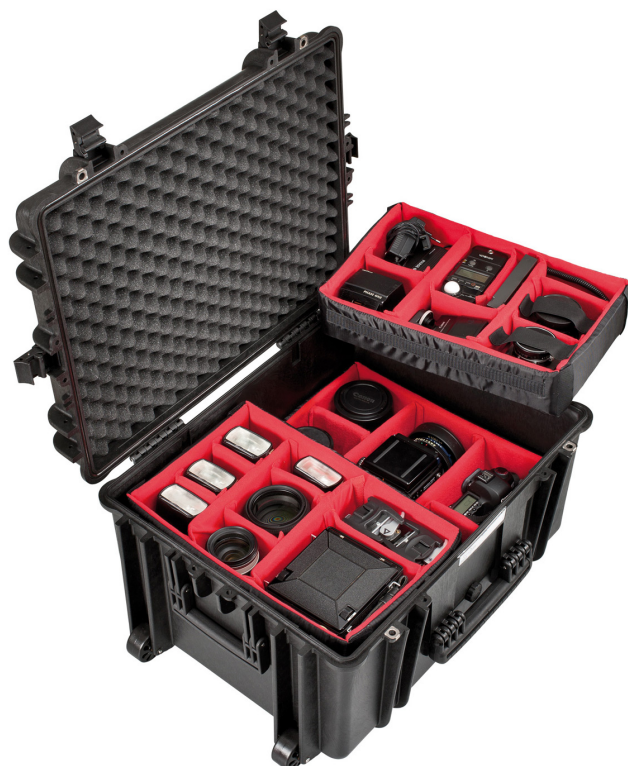
Photo cases made in injection molded PP material. Equipped with three padded dividers sets to store professional camera gears.