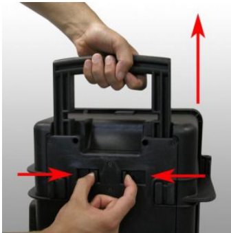
EASY TO OPEN RELEASE TELESCOPIC HANDLE (model 5122)